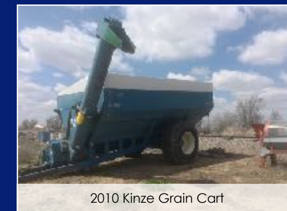
2010 Kinze Grain Cart